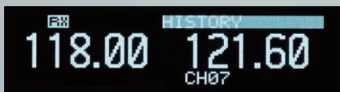
Operating information is clearly shown on the OLED display.

A fixed mount VHF airband first! The IC-A210 has an organic light emitting diode (OLED) display. The OLED display emits light by itself and the display offers many advantages in brightness, vividness, high contrast, wide viewing angle and response time compared to a conventional display. In addition, the auto dimmer function adjusts the display for optimum brightness at day or night.